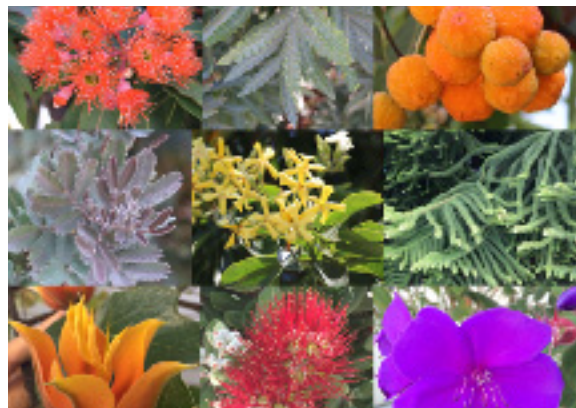
These are some of the drought-tolerant trees.